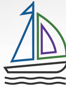
Exhibit Rules & Regulations